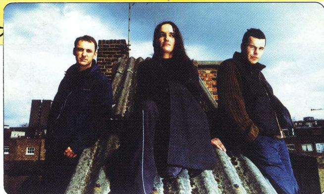
KOSHEEN HIDE U / EMPTY SKIES (MOKSHA)

This first release for Kosheen on Moksha is one of the most talked about tunes on the drum & bass scene at present. No doubt many of you will have already heard this, but if you not, then make room for one of the most original and uplifting vocal tunes of late. It would be easy to say that it's all about the vocal here, but this track's success is equally due to the way the drum & bass elements have been put together: without ever overshadowing the sumptuous vibe that naturally shines through. Breathtaking stuff. L